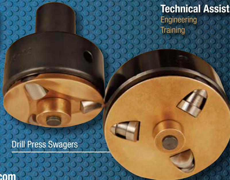
Drill Press Swagers